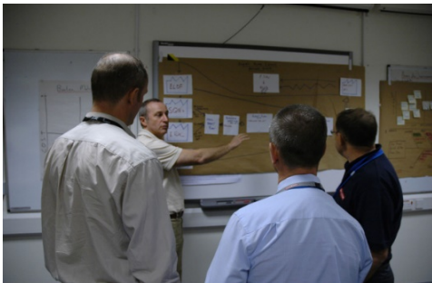
Discussing current business performance

This 2 Day Leadership Training will help you create high level Leadership engagement, alignment and develop a roadmap for your Lean Transformation journey using our Transformational evolution 'Learner to World Class' matrix and developing a Lean Vision and Strategy.