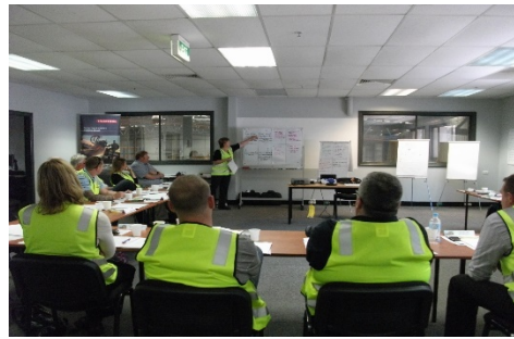
Classroom Leadership Training with Execs