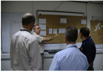
Coaching in groups or 1 x 1

Lean Coaching and Support helps provide you with ongoing support, awareness, additional knowledge and accountability to develop as a Lean leader for your business, accelerate the lean journey and support your own personal transformation.