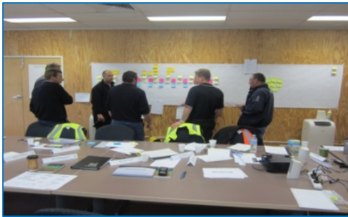
Team Practical Problem Solving

The Lean diagnostic is a 3 -5 day structured approach to evaluate and diagnose the problems, issues and opportunities that lie within a key business process (value stream). The approach involves prioritising, choosing and mapping an 'end to end' process through team based problem solving systematically identifying and eliminating waste