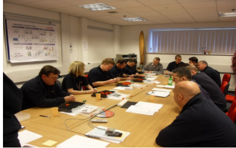
Practical Problem Solving Simulation Game

+ Practical Problem Solving is a team based problem solving course to help identify, prioritise, develop potential causes, solve problems to root cause and enhance decision making to implement the best countermeasures and avoid future problems.